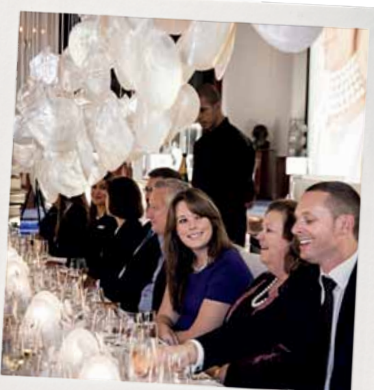
The 30 dinner guests — some lucky enough to borrow a strand of pearls for the evening — enjoyed a menu skilfully created by Peter Gilmore.