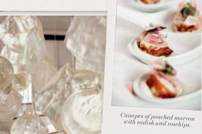
A polished mother-of-pearl chandelier created by architect Tina Engelen, comprising 150 pearl shells, was suspended over the table.