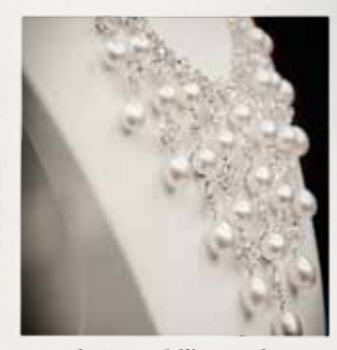
The 'Waterfall' Australian South Sea pearl necklace.